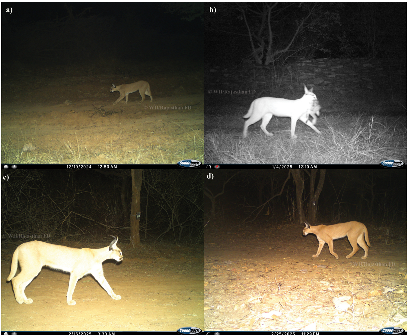
Figure 2. Photo-captures of the caracal from the present study. a) First photo-capture in RVTR. b) Caracal carrying a lagomorph in RVTR. c) First photo-capture of caracal in MHTR. d) Last Photo-capture of caracal in MHTR during current study.

et al. , 2021). It is possible that the individual photo-captured in the present study might be dispersing from Ranthambhore (Phalodi region). Caracals are large ranging species, and are known to cover larger distances in resource sparse areas (Norton & Lawson, 1985; Bothma & Riche, 1994; Avenant & Nel, 1998; van Heezik & Saddon, 1998; Marker & Dickman, 2005). The probability of RVTR and MHTR harboring sizable caracal populations currently is low (given no photographic captures in the recent surveys). These recent photo-captures of caracal have revived the hope for caracal conservation in the semi-arid western Indian landscape and highlighted the importance of rigorous scientific monitoring to record rare and elusive species, such as caracal. Dedicated species-specific studies focused on population status, habitat use, ranging pattern, and genetic assessment are required for developing effective conservation strategies to safeguard the species' long-term viability (Jhala et al. 2021; Khandal & Dhar 2024).